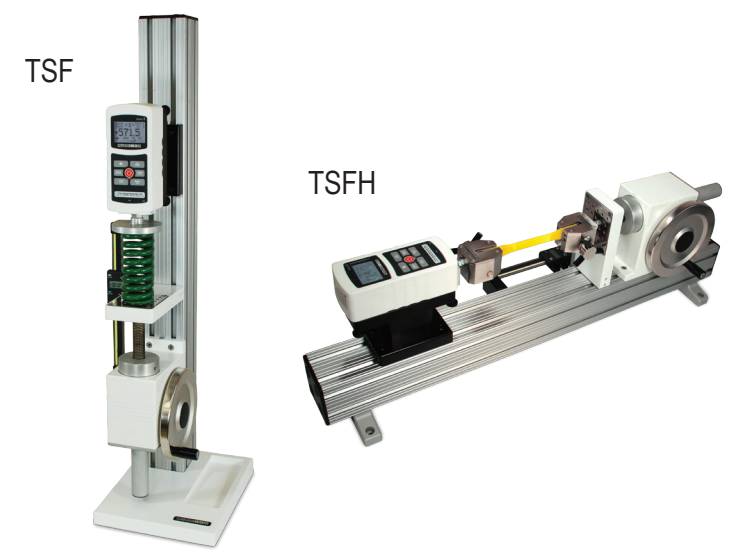
The TSF is shown testing a compression spring, with a Series 5 digital force gauge and digital travel display