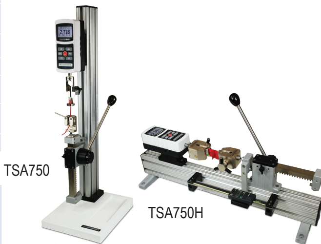
The TSA750 and TSA750H are shown testing the peel force of a sample, with a Series 5 digital force gauge, and film & paper grips