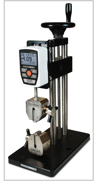
Shown with an ES20 test stand and G1061 wedge grips

Series 3 gauges include MESUR™ Lite data acquisition software, for tabulation of continuous or individual data points. One-click export to Excel button easily allows for further data manipulation.